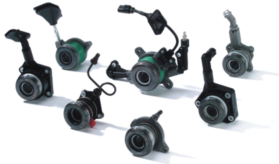
Concentric slave cylinders of the latest generation