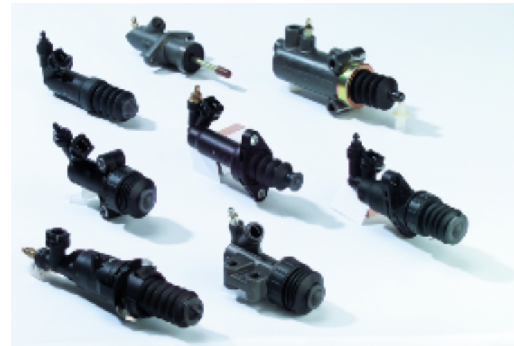
Clutch master cylinders of the latest generation

Mineral oil consisting clutch slave cylinder MKN22065A1 ↑ ↑ Diameter (mm)