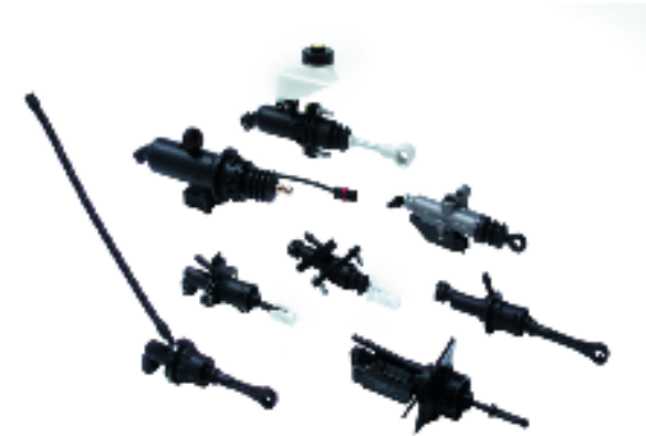
Clutch master cylinders of the latest generation

Mineral oil consisting clutch master cylinder MKG23852.4.1 ↑ ↑ Diameter (mm)